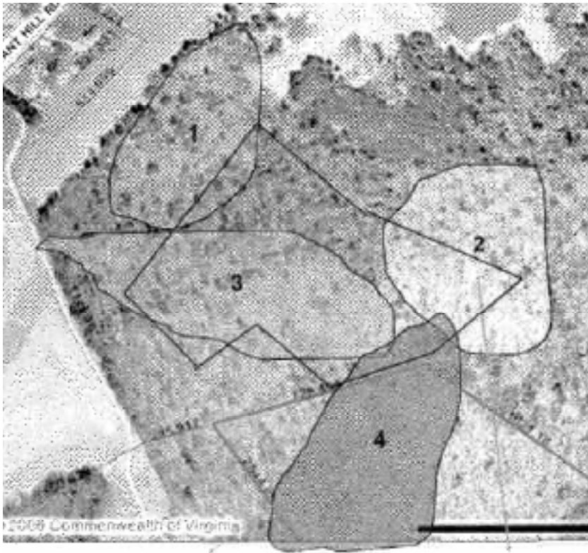
Figure 1. The home range of four box turtles on the study site. The area that was clearcut logged and chipped is approximated by the black polygon. Turtle #1 stayed in or near the riparian buffer indicated by the upper ellipse during the entire study. Turtle #2 left the site during logging, but returned following logging and remained under logging debris for approximately one month in the middle of a period of hot and dry weather. Turtle #3 remained on the site during logging and was killed (presumably by being run over by a skidder) in early July. Turtle #4 left the site during logging (black line) and did not return to the site. Because they travelled long distances from the study area, the home ranges shown for turtles #2 and #4 are larger than the shaded areas in the figure.