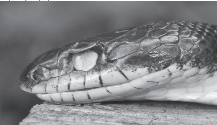
Figure 1. Anophthalmia in Pantherophis alleghaniensis from King George County, Virginia.