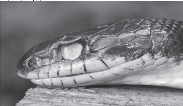
Figure 1. Anophthalmia in Pantherophis alleghaniensis from King George County, Virginia.