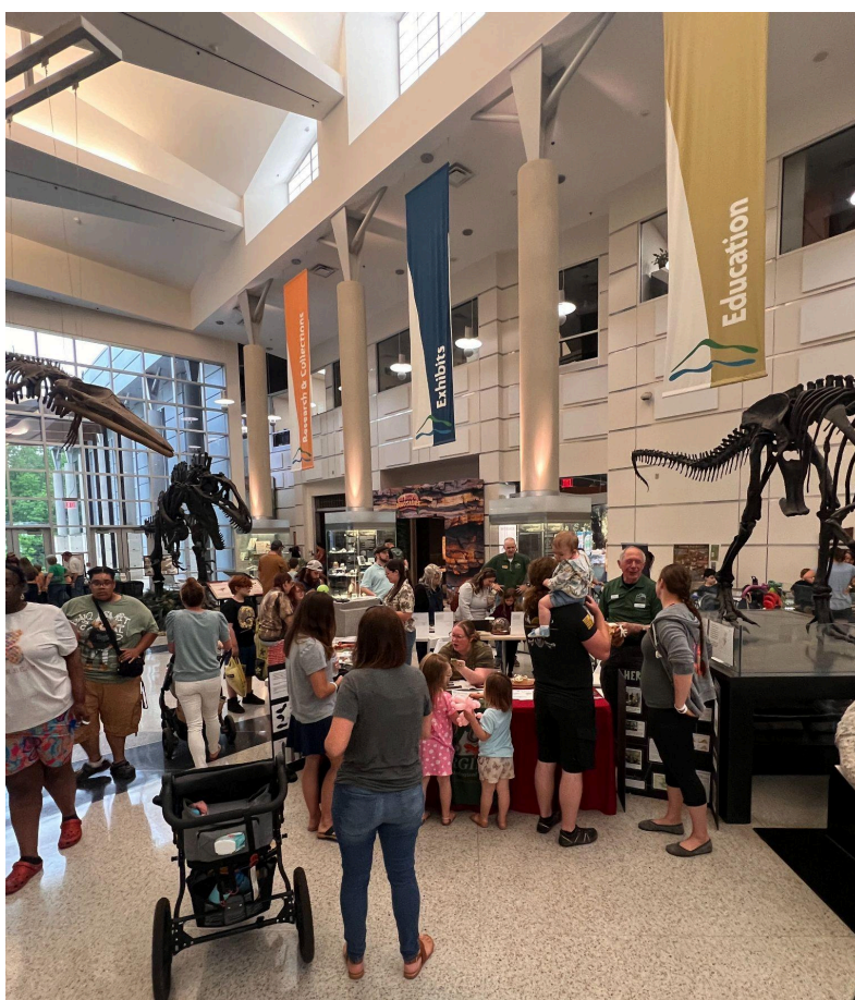
Lots of folks enjoying the VHS exhibit at the fabulous VMNH!