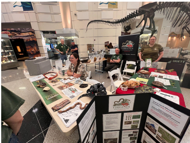
Great looking table display!